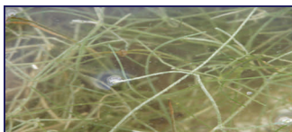
Dense mats of Starry Stonewort, often several feet thick, can make boating nearly impossible