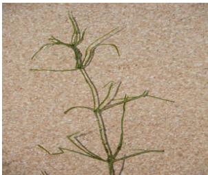
Starry Stonewort ( Nitellopsis obtusa )

In a “spectacular” display of its ability to disrupt inland lake ecosystems, Starry Stonewort, an invasive macro algae first observed in Michigan waters in 2005, has severely degraded the overall quality and recreational viability of Round Lake, located seven miles southeast of Brooklyn, Michigan,